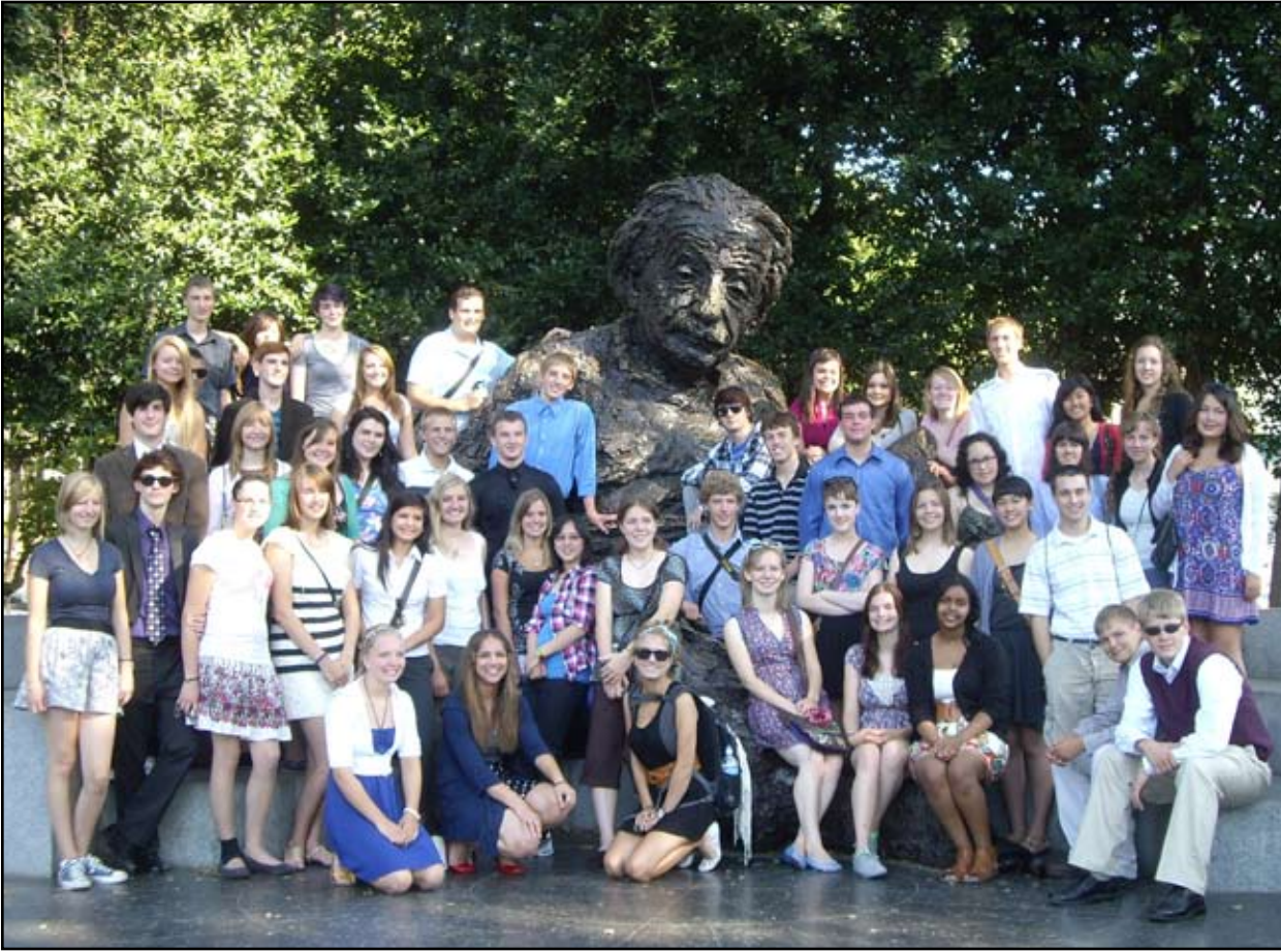
ASSE American CBYX (Congress Bundestag) Scholarship Exchange Students gathered in early August 2011 in Washington DC for an orientation before departing to Germany. During the 3 day orientation, students visited the offices of Senators /Representatives from their home state; visited and learned about the US Capitol / National Monuments; met with US State Department CBYX program officers and had discussion sessions to prepare for the new cultural experience awaiting them in Germany

ASSE is very grateful to receive so many photos from around the ASSE world! Enjoy the following examples of all of the fun!